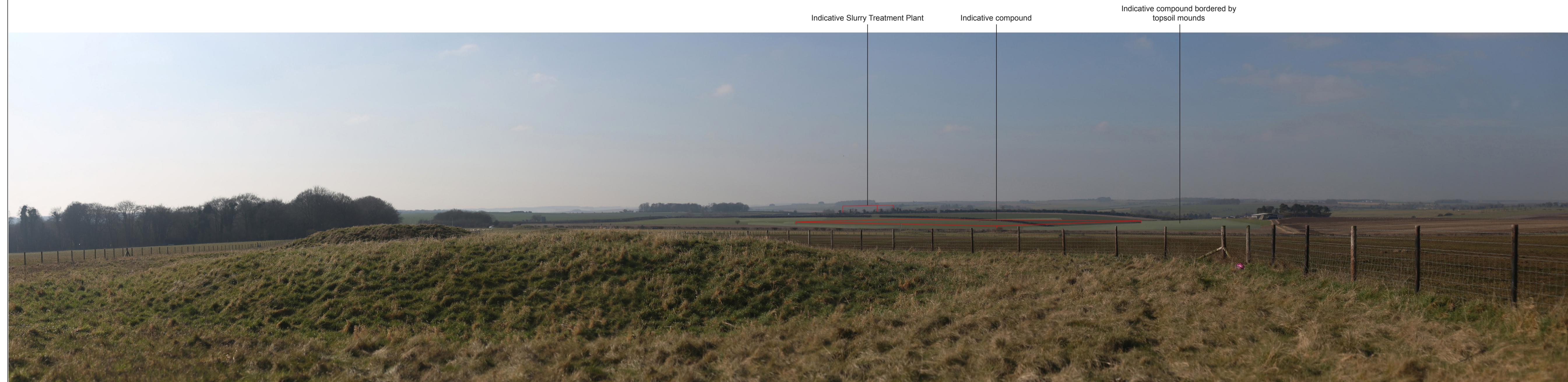
PROPOSED (WINTER - CONSTRUCTION)